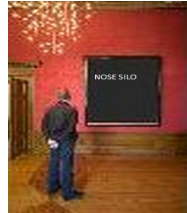
This is a Nose Silo Ebook

to erect a monument of folly very like this French monument. If that be done, the consequences are obvious. The leather trade will be ruined, by the introduction of American timber, to be manufactured into shoes for the fallen English; the Lord Mayor will be required, by the popular voice, to live entirely on frogs; and both these changes will (how, is not at present quite clear, but certainly somehow or other) fall on that unhappy landed interest which is always being killed, yet is always found to be alive—and kicking.