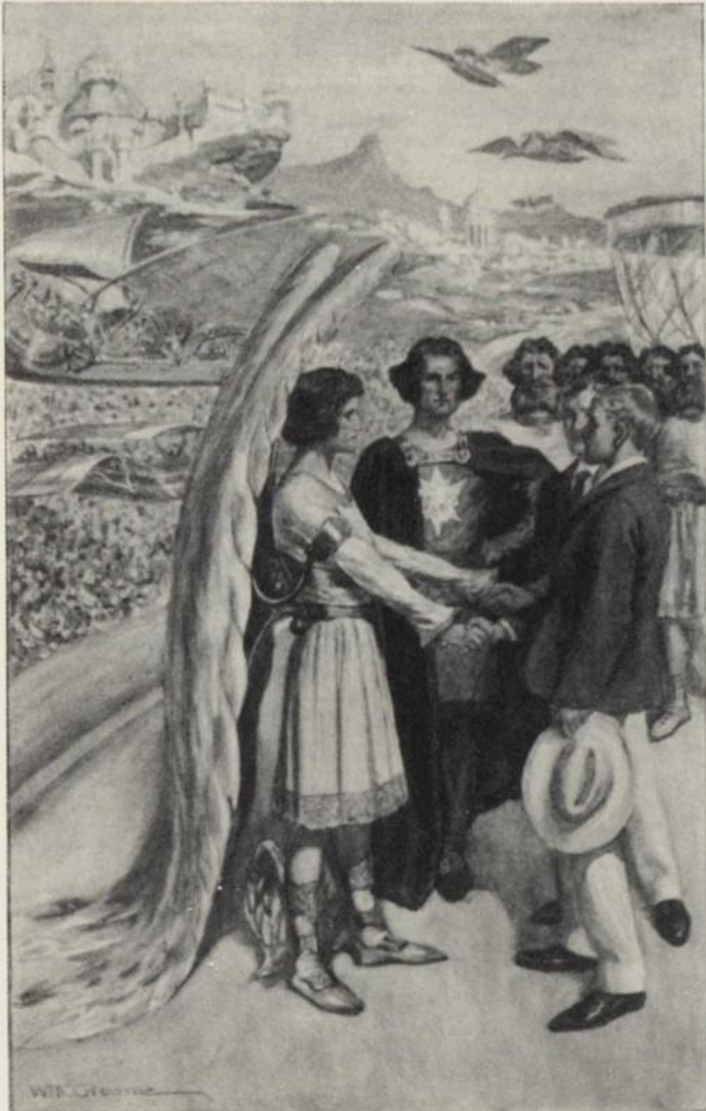
They returned his greeting as heartily as it was given. M.— Front . PAGE 91.

They returned his greeting as heartily as it was given.— Front . PAGE 91 .